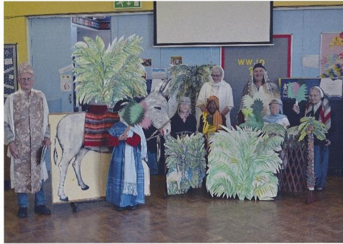
Open the Book team at Grove C of E, North Drive, Palm Sunday 2014